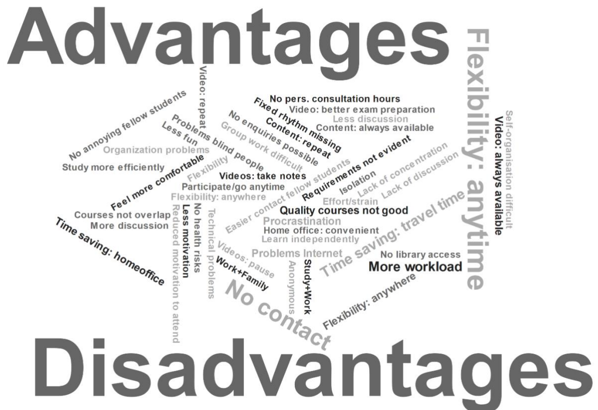
Figure 1. Word cloud: Advantages and disadvantages of digitisation

in the evaluation of digital teaching depending on various socio-demographic characteristics or heterogeneity characteristics. For example, students from more highly educated parents consider digital teaching to be a good substitute for face-to-face teaching more often than others. People with disabilities state more often that they cannot cope with the challenges of studying during COVID-19. However, further studies are needed to draw far-reaching conclusions. Nevertheless, it has become clear how important it is to pay attention to the social context of the students and to include appropriate questions in surveys.